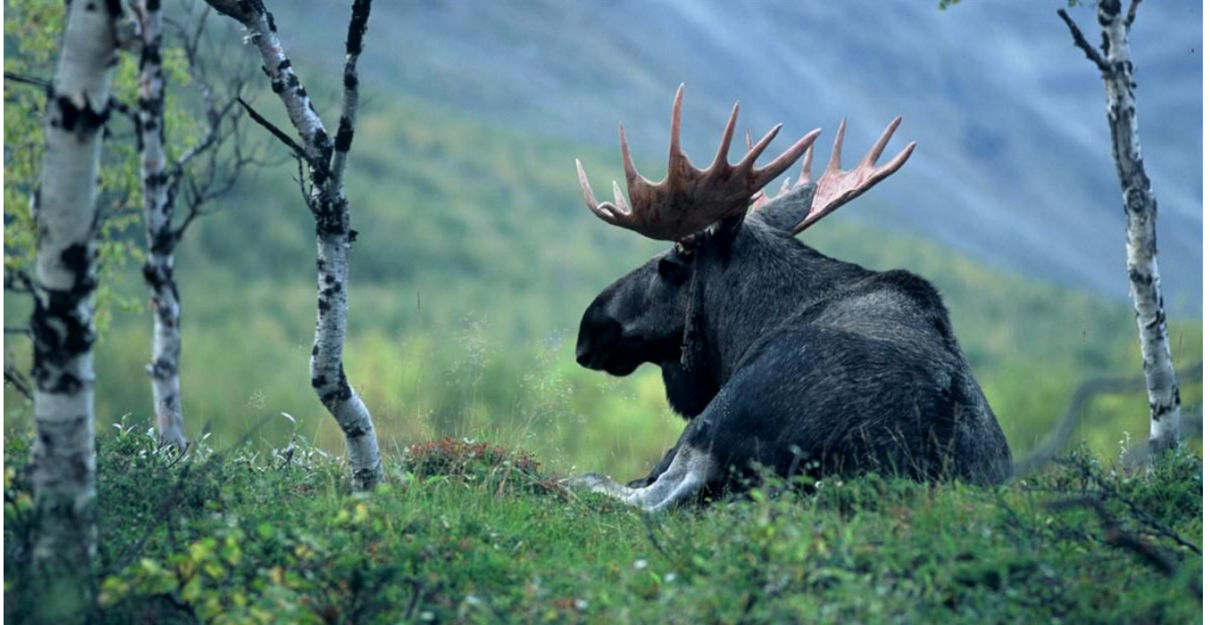
Elk resting below Sonfjället, Jämtland