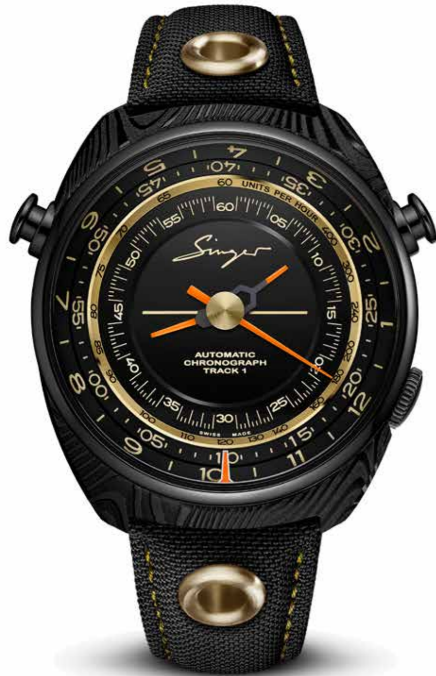
Singer Track1 Only Watch Edition