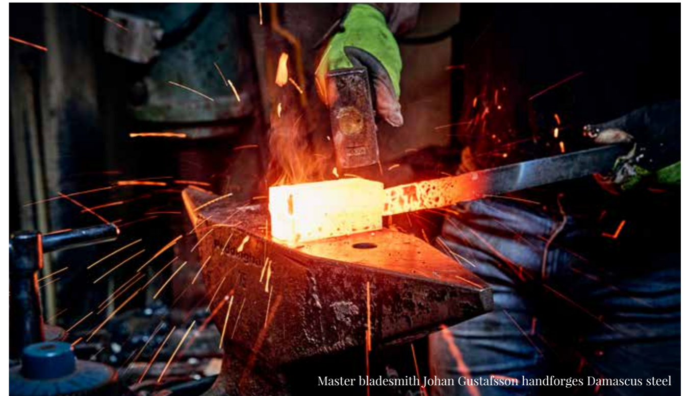
Master bladesmith Johan Gustafsson handforges Damascus steel

The first and only black damascus steel version of Track1 chronograph