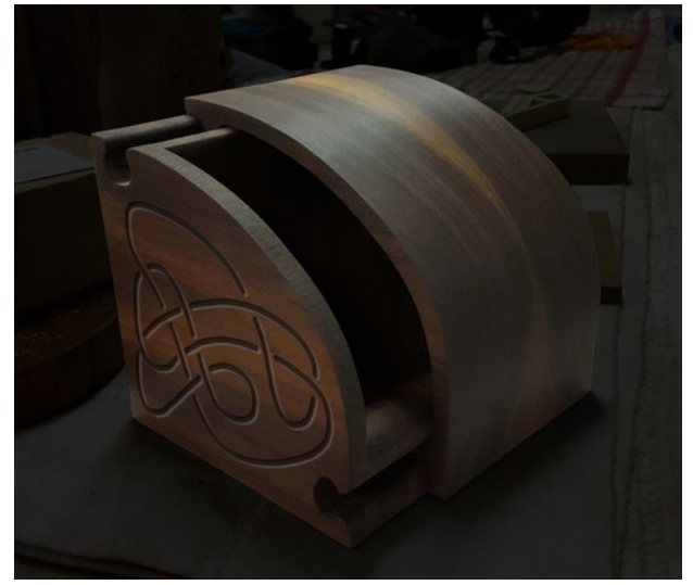
The presentation box for Väring is adorned with a viking knot pattern also seen in the lugs of the watch