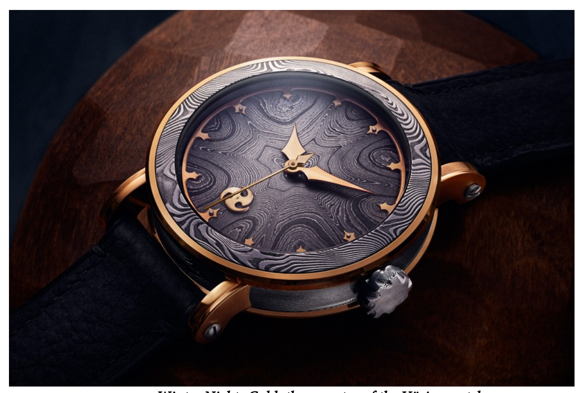
Winter Nights Gold, the ancestor of the Väring watch

The technical specification of the GoS Väring watch is shared with the second edition of the GoS Winter Nights. The movement is based on the Technotime TT718 which is manually wound and with a five days power reserve. Winter Nights gold featured the first bi-metal GoS watch and is one of the watches that have received the most attention, e.g. headlining an article on watches "with a wow-factor" in Financial Times.