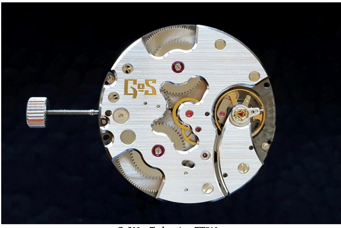
GoS02 - Technotime TT718