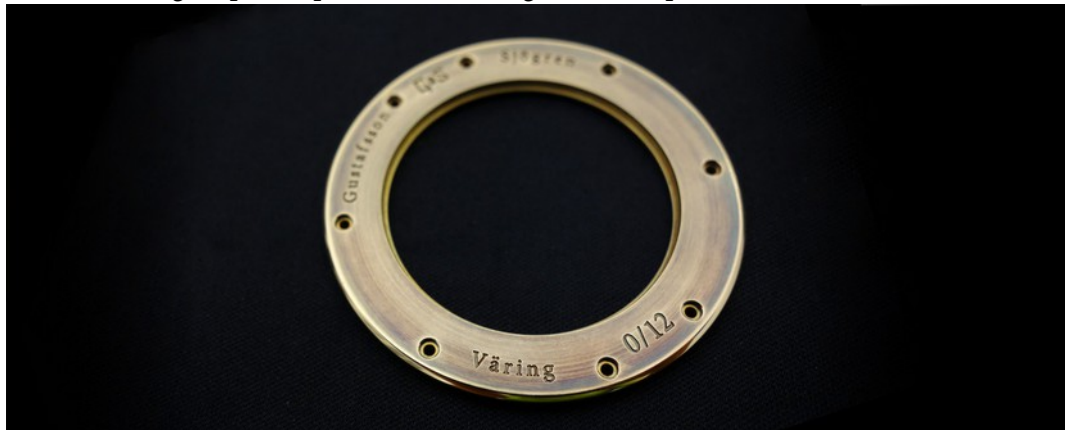
Case back prototyping

GoS honors the Swedish Vikings by creating our first Bronze watch. Bronze was the most common metal to be used and mastered by Vikings. Steel was mainly for weapons while Bronze was preferred for most other items, both decorative and functional. The case of GoS Väring has a center ring in Stainless damascus steel while all other parts are made of Bronze. The shape and overall design of the case is recognizable from previous GoS models but with new viking-inspired details added. Some of the changes are subtle, like the lug shape which has been altered to better resemble the bow ornaments of viking ships. Others are immediately identifiable as viking elements such as the viking loop knot patterns on the lugs, for example.