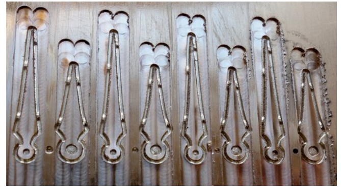
Prototyping of new GoS bronze hands with bevels yet to be handpolished

The chapter ring and hands are also made of Bronze and share the same finishing elements with rich contrasts between pre-patinized slightly darkened surfaces and polished chamfers. GoS has always aimed to create rich contrasts in our Damascus steel finishing and bring this to the Bronze finishing too. The hands for the Väring watch features the familiar viking spear outline but will premiere a newly developed surface finishing that makes the surface appear to be curved, just like spear heads. It is inspired by the traditional Swiss Côtes de Genève but done in a new way.