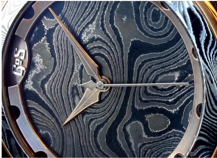
GoS bronze hands and chapter ring with highgloss polished bevels

contrasts in our Damascus steel finishing and bring this to the Bronze finishing too. The hands for the Våring watch features the familiar viking spear outline but will premiere a newly developed surface finishing that makes the surface appear to be curved, just like spear heads. It is inspired by the traditional Swiss Côtes de Genève but done in a new way.