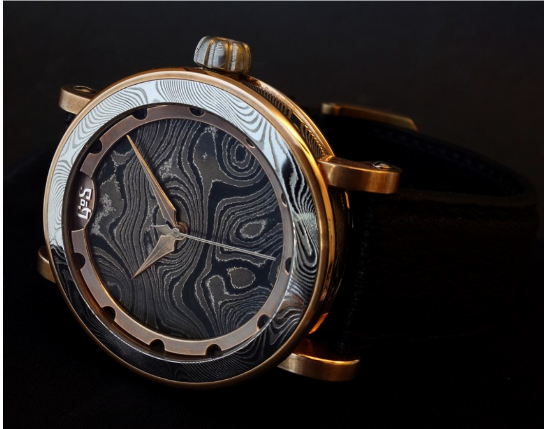
GoS Väring – a Viking warrior watch in all bronze and damascus steel

GoS honor Väring and Swedish Vikings by creating our first Bronze watch. Bronze was the most common metal to be used and mastered by Vikings. Steel was mainly for weapons while Bronze was preferred for most other items, both decorative and functional. The case of GoS Väring has a center ring in Stainless damascus steel while all other parts are made of Bronze. The shape and overall design of the case is recognizable from previous GoS models but with new viking-inspired details added. Some of the changes are subtle, like the lug shape which has been altered to better resemble the bow ornaments of viking ships. Others are immediately identifiable as viking elements such as the viking loop knot patterns on the lugs, for example.