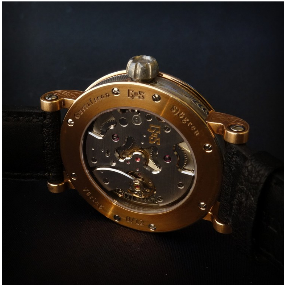
GoS02 – Technotime TT718