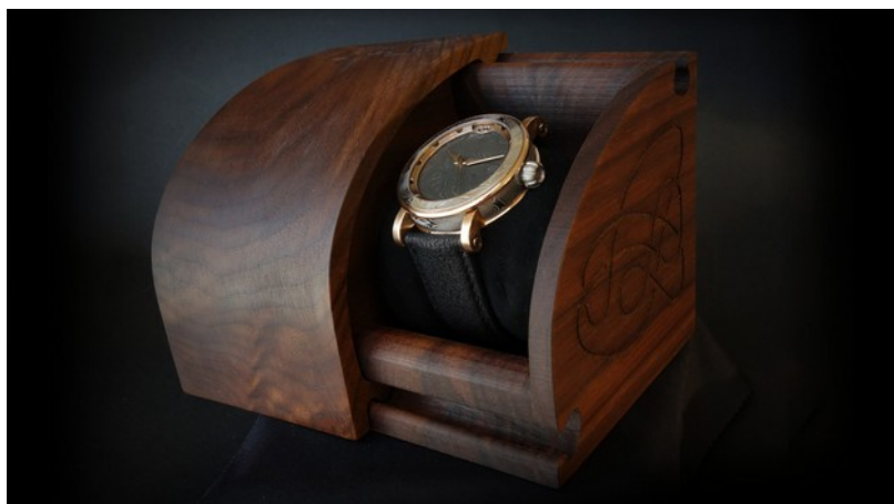
The presentation box for Våring is adorned with a viking knot pattern also seen in the lugs of the watch

GoS watches are presented in walnut wood boxes, handcrafted by the local sculptor and artisan Kanevad.